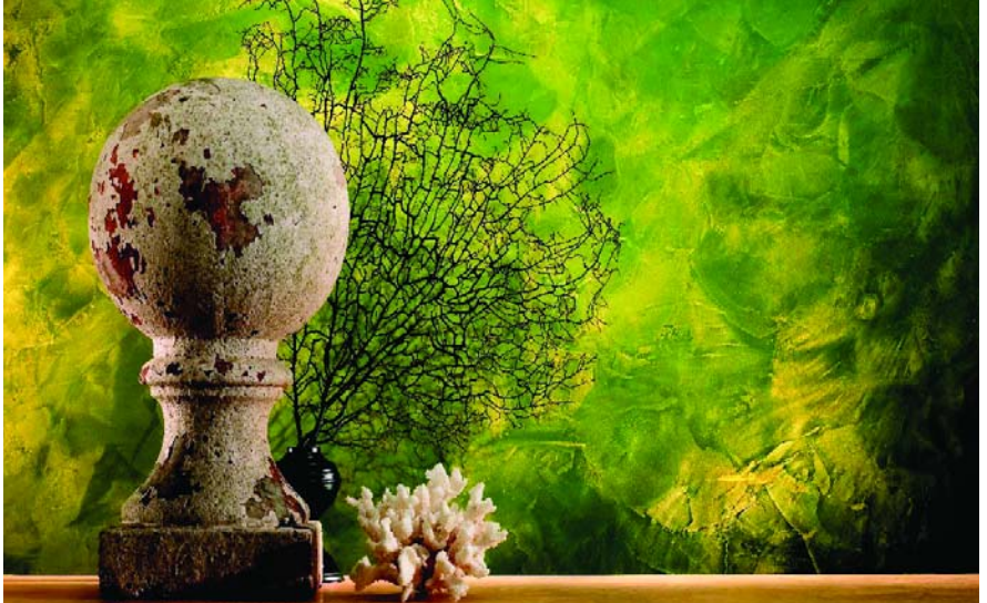
● Aureum from DecoFinish, LLC has a rich-looking appearance that draws the eye.

ties, and finally a third article discusses the eco-friendly direction of faux.