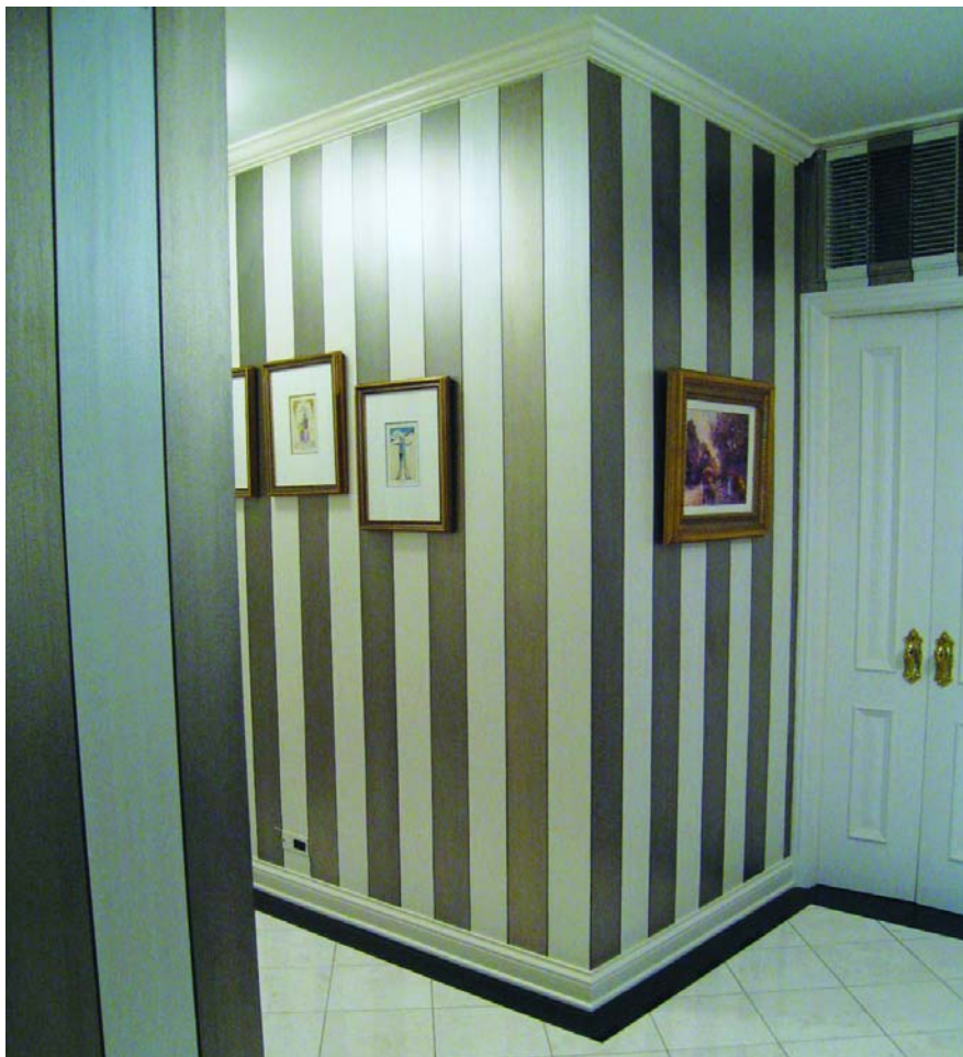
● Stephanie Gabel, owner of Roux Design Chicago, Ill., used Crescent Bronze products to create a “wow” factor for this Chicago penthouse.

©2008 Hyde Tools, Inc. All rights reserved. 15470