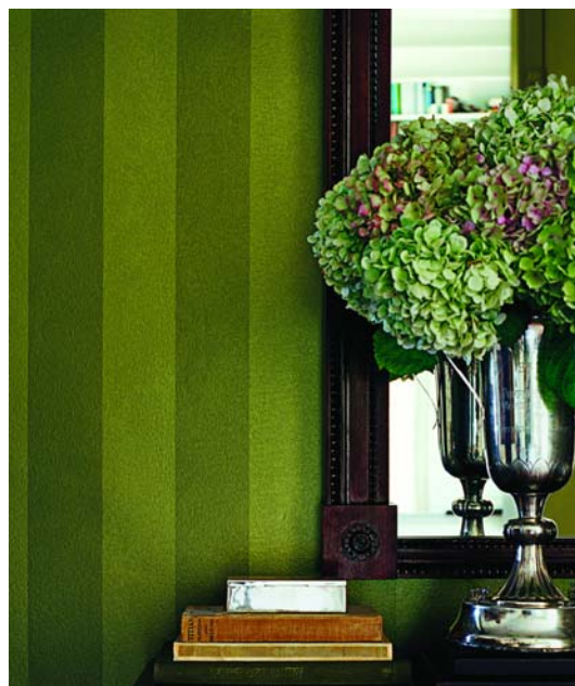
● Ralph Lauren addressed the metallic trend with Regent Metallics, a collection of luminous paint that brings timeless luxury to walls, trim and architectural elements.

DecoFinish addresses the trend toward metallic coatings with another new product, Imperium, a pure metallic paint with a high concentration of pigment. This gives the wall or ceiling a bright metallic look. “It offers high coverage and is easy to blend,” Benalloun said.