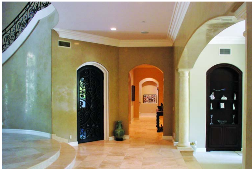
● Modern Masters’ Venetian plaster was used to add drama to this entranceway.

The other key market trend continues to be metallic coatings. This is an