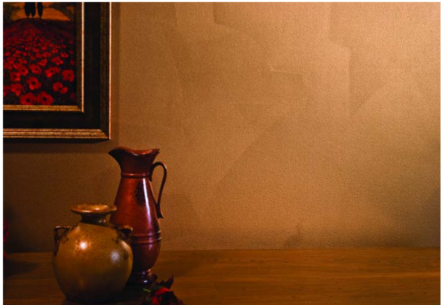
● Roman’s ArmorMetalix™ 100% Pure Metallic Coating was used to create this finish in Galleria Gold.

products that fill the desire for metallic and/or shimmery looks, including the company’s Metal Effects reactive metallic paints, Shimmerstone and Metallic Paint Collection.