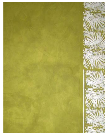
● Adicolor Inc.’s products work well in the simpler, more contemporary looks that are favored today.