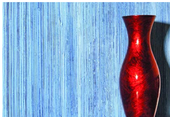
● Nahir by Atova International Inc. is in keeping with a trend toward use of linear designs.