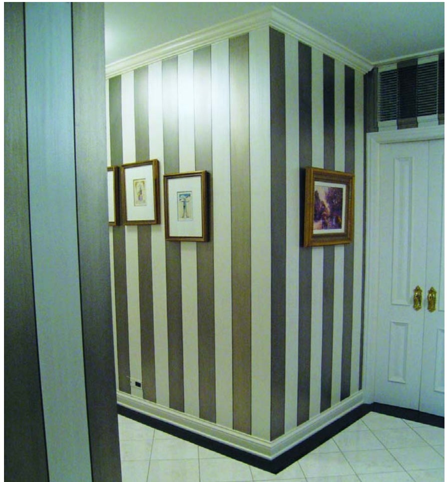
● Stephanie Gabel, owner of Roux Design Chicago, Ill., used Crescent Bronze products to create a “wow” factor for this Chicago penthouse.

©2008 Hyde Tools, Inc. All rights reserved. 15470