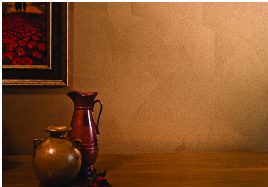
● Roman’s ArmorMetalix™ 100% Pure Metallic Coating was used to create this finish in Galleria Gold.

products that fill the desire for metallic and/or shimmery looks, including the company’s Metal Effects reactive metallic paints, Shimmerstone and Metallic Paint Collection.