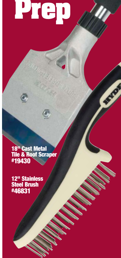
18" Cast Metal Tile & Roof Scraper #19430