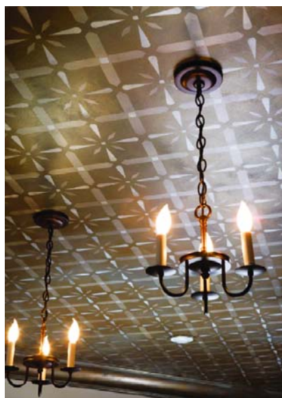
● Benjamin Moore Metallic Glaze, used for this ceiling, is part of the Benjamin Moore® Studio Finishes® line of decorative products.

Mattingly believes that Roman Decorating has tapped into one of the hottest trends in the faux-finish market—the use of metallics—with the introduction of this product. “A wall finished with ArmorMetallix can take color to another dimension by adding drama and glowing effects to a room,” he said. “Take that same idea and add a layer of our ArmorFaux™ Glaze & Varnish over the metallic coating and you can create a subdued shimmering effect with the metallic popping out from underneath. You can also use ArmorFaux™ Decorative Acrylic Texture Coatings as a base and top coat to create popular Tuscan, Striae, Travertine and Fresco effects and then make