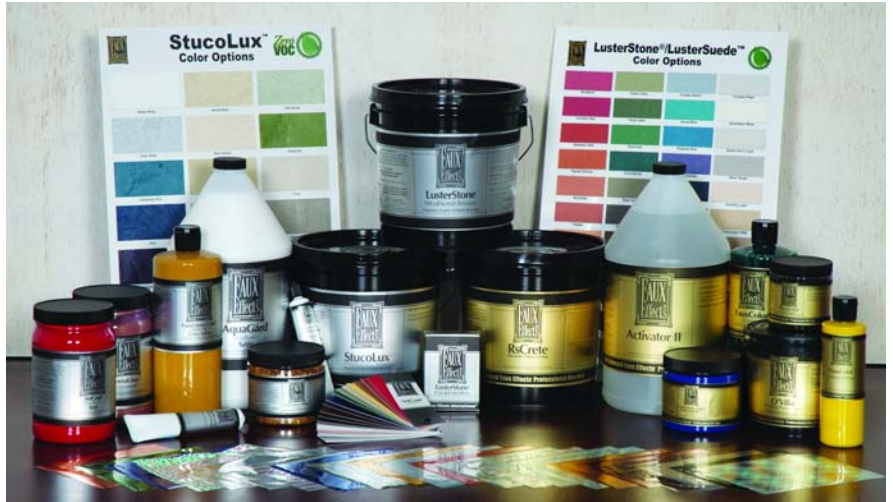
● The Faux Effects International Inc. line of products includes StucoLux.

©2008 Hyde Tools, Inc. All rights reserved. 15492