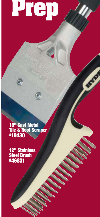
18" Cast Metal Tile & Roof Scraper #19430