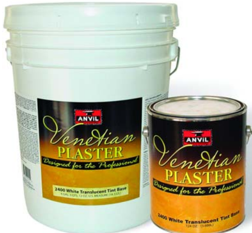
● Anvil Professional Venetian Plaster 2400 offers unlimited dealer mixed colors.

Targeting the high-end market has been a positive for DecoFinish, which is posting positive