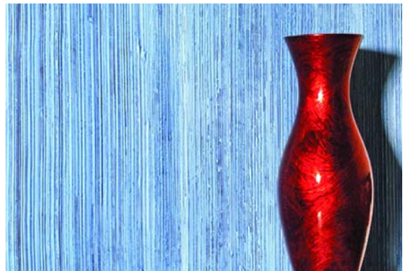
● Nahir by Atova International Inc. is in keeping with a trend toward use of linear designs.