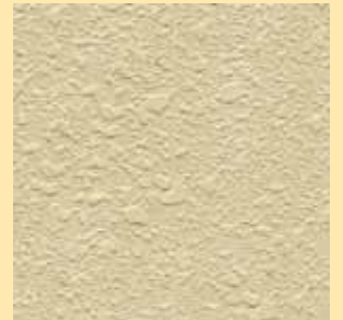
Splatter finish technique.

Anvil Ultra Tex 2200 combines the color diversity of paint with the texture options of plaster to deliver the most versatile wall covering available. Unlike paint and drywall texture, Ultra Tex 2200 offers solid color completely throughout the finish for added durability. Color choices for the base and texture coats range from pastel to medium, and can be custom-color matched to project specifications. A skilled contractor/applicator can achieve a variety of textured finishes. Design options are limitless with the new aggregated texture choices.