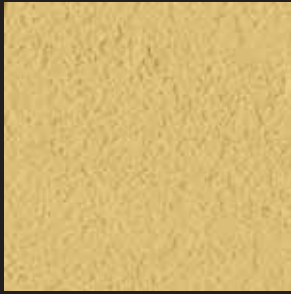
Typical example of small knockdown.

Anvil Ultra Tex 2200's unique consistency quickly and effectively hides surface imperfections, fills nail holes and bridges small cracks with little or no additional work beyond normal application. Combined with Ultra Tex's infinite array of texture and color combinations, it's the perfect solution for textural wall surfaces.