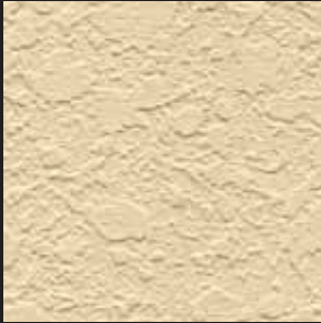
Knockdown texture technique.

With an exciting array of new textured wall options in countless design choices and colors, not only is Anvil Ultra Tex less expensive than vinyl wallpaper, it provides superior breathability, resistance to mold and mildew, and is ruggedly durable, cleaning up with soap and water.