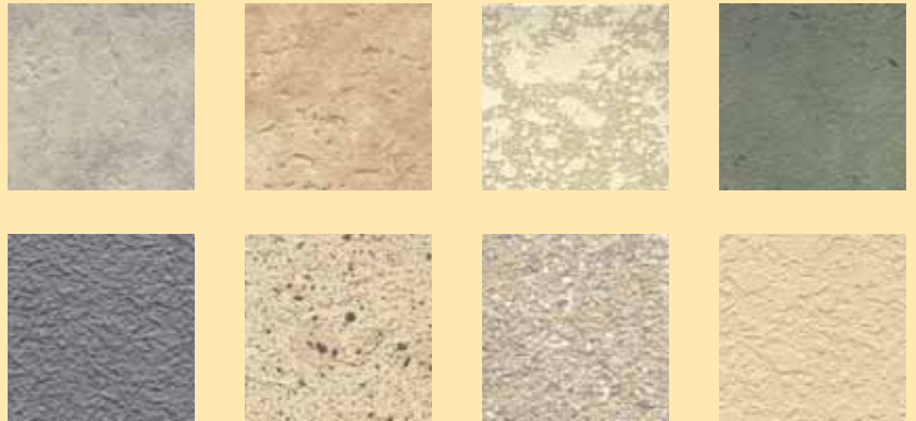
Unlimited textural effects and color combinations.