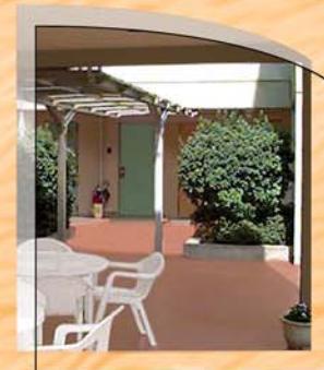
Patios and Porches

Manufactured with pride by Anvil Paints & Coatings, Inc. 1255 Starkey Road, Largo, FL 33771 • 1-800-822-6776 www.anvilpaints.com